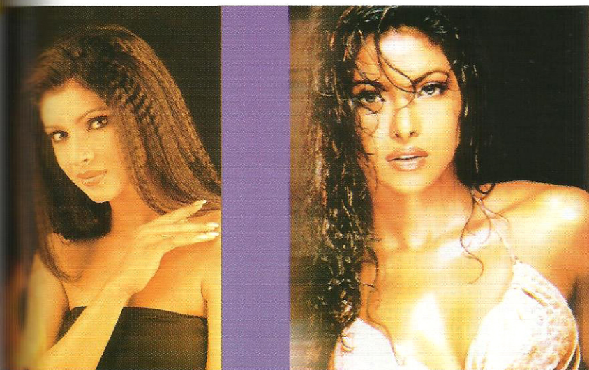
Priyanka Chopra: Before and after her nose job

What it takes: The excess skin is cut off and the eyelid re-joined to give a tighter, toned