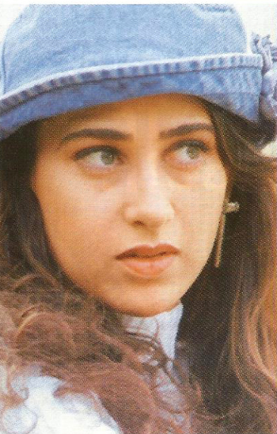
Karishma Kapoor: Before and after the jawline re-structuring