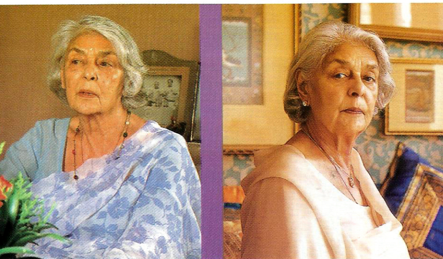
Maharani Gayatri Devi: Before and after the touch up

Pretty Packet: A forehead lift costs anywhere between Rs 12,000-25,000. As much